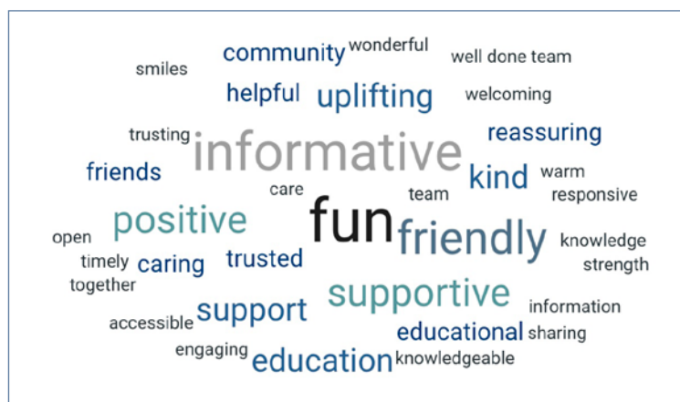
Figure 3. Word cloud illustrating the three words to describe the Diabetes 101 team, as reported by users.

The whole community (adults, CYP and parents) found the account fun, informative and positive (Figure 3). When asked about their primary reason for accessing the account, most respondents (45.5%) indicated that they were looking for accurate information and the vast majority of account users (92%) indicated that they would recommend the account to friends, family, other PWD and diabetes HCPs.