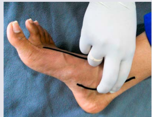
Feeling for a Posterior Tibial pulse.