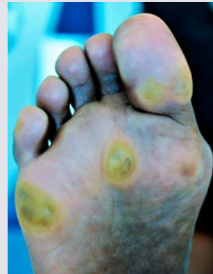
Plantar callus with evidence of underlying blood staining.