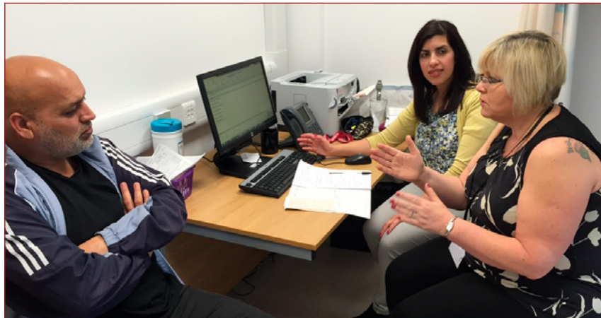
Figure 3. A joint consultation approach in a general practice. A pharmacist conducts a bilingual review alongside a diabetes specialist nurse.