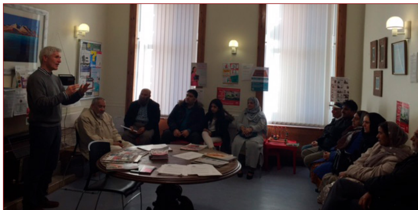
Figure 2. A pharmacist-led group education session delivered by a local diabetes consultant for South Asian individuals in a general practice waiting room.