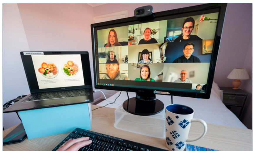
Figure 2. An online education session.